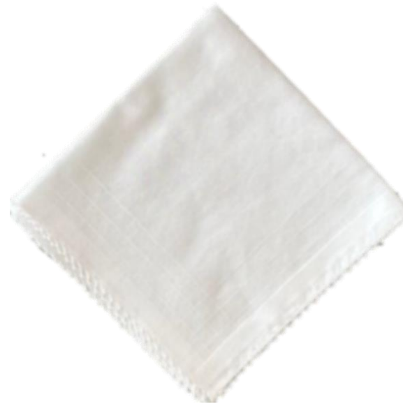
CUSTOM WHITE LINEN DINNER NAPKIN WHITE PICOT EDGE 22x22"