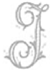
MONOGRAM: ARABESQUE J